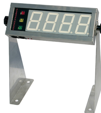
Minidisplay 27x10 cm

For more information or orders, call us at +45 74 44 26 36 or e-mail danage@danage.dk