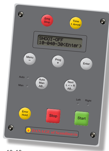
Controller 13x18 cm